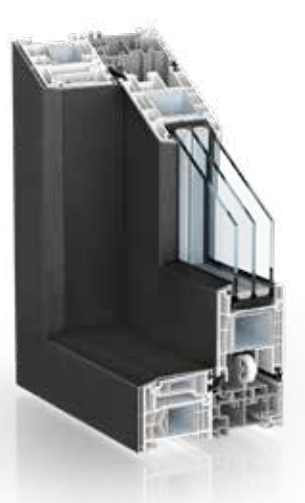
Kömmerling PremiSlide 76 AluClip with combined outer frame made of PVC-U and aluminium