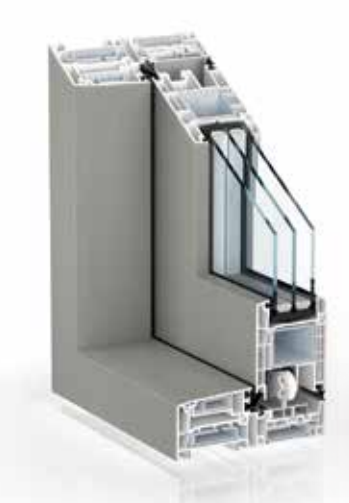
Kömmerling PremiSlide 76 Standard laminated with PVC-U frame