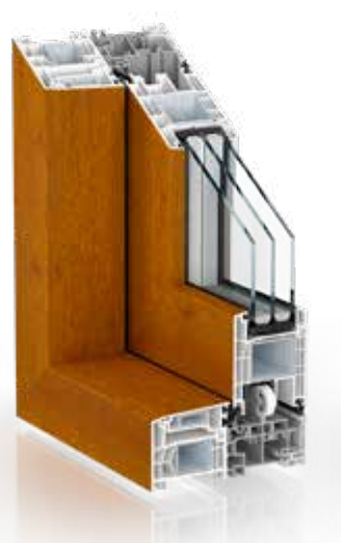
Kömmerling PremiSlide 76 Standard laminated with combined outer frame made of PVC-U and aluminium