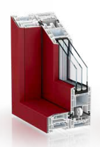
Kömmerling PremiSlide 76 AluClip with PVC-U frame